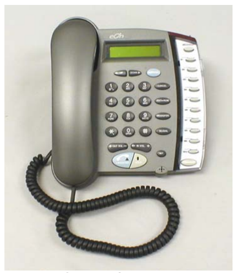
eOn IP Phone 500

Choosing the right solution for your enterprise communications needs should not be constrained by technology limitations. That's why eOn Communications has made the choice simple with Millennium IPConnect. With IPConnect, the Millennium System offers IP, digital and analog technologies—enabling you to deploy traditional, IP telephony or a combination of both when and where it's right for your organization.