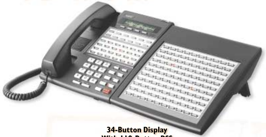
34-Button Display With 110-Button DSS