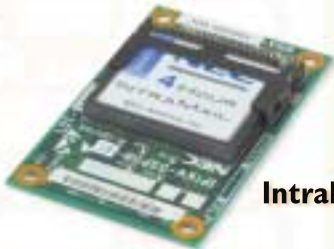
IntraMail Voice Mail