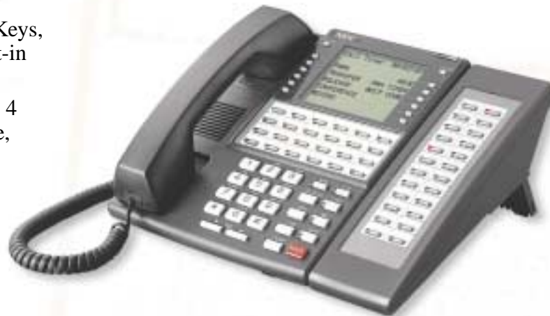
34-Button Super Display With 24-Button DSS